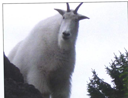
New animal habitat