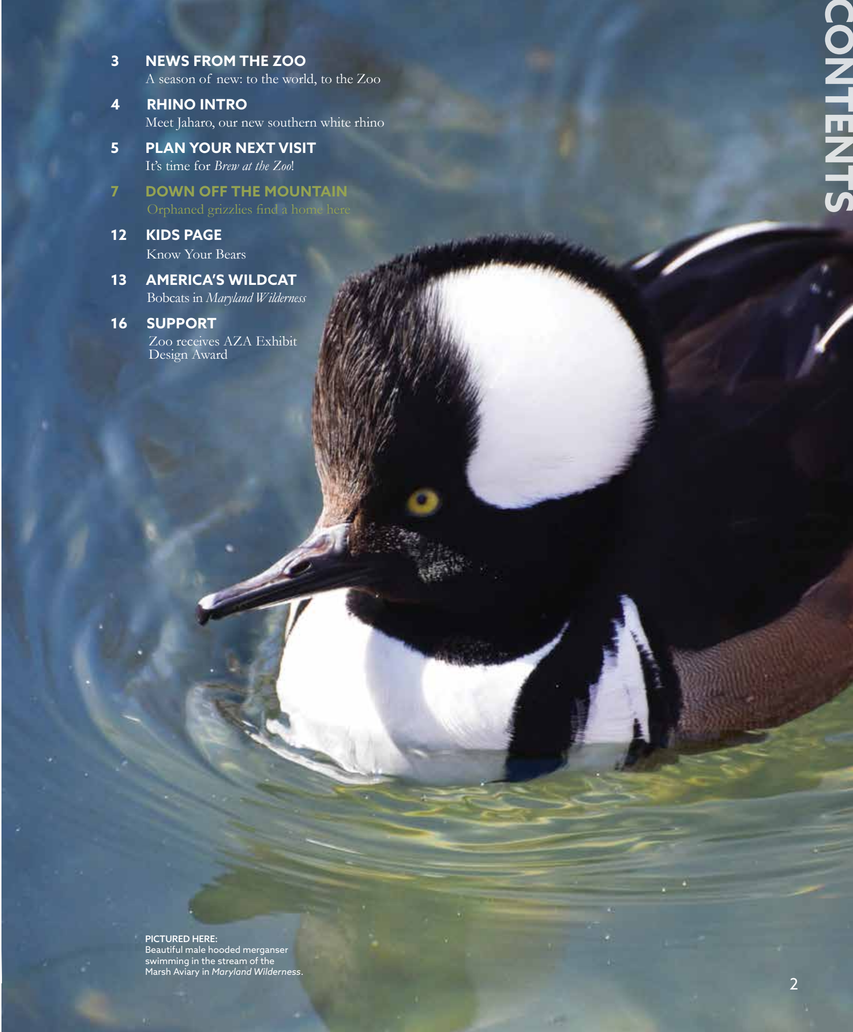
PICTURED HERE: Beautiful male hooded merganser swimming in the stream of the Marsh Aviary in Maryland Wilderness .