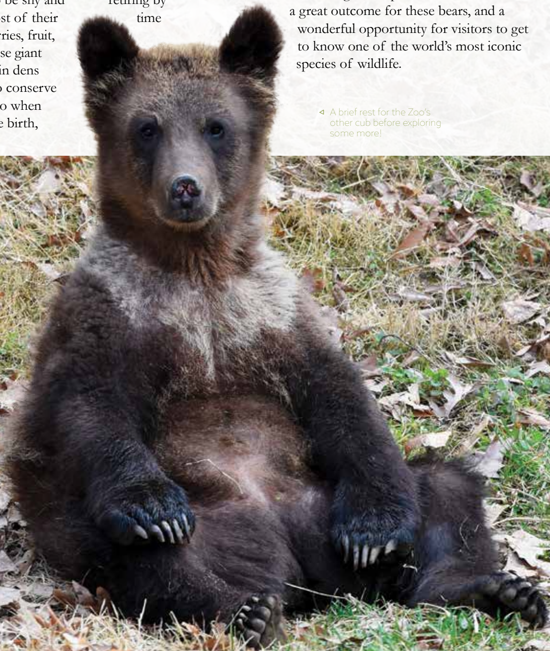
◀ A brief rest for the Zoo's other cub before exploring some more!

It is a thrilling development for the Zoo, a great outcome for these bears, and a wonderful opportunity for visitors to get to know one of the world's most iconic species of wildlife.