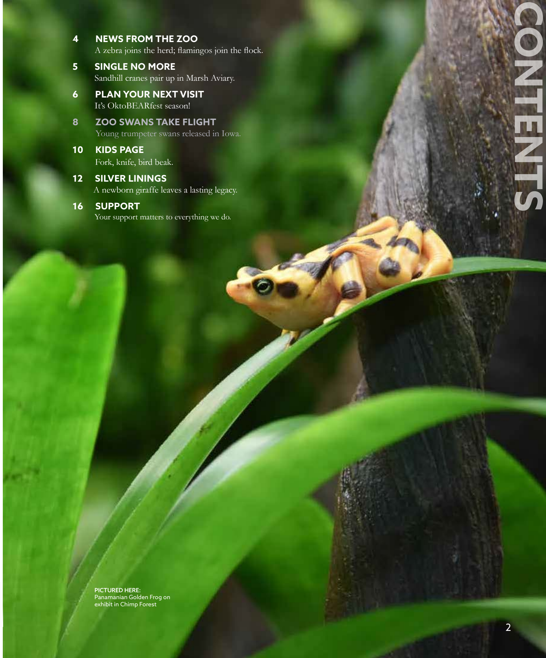
PICTURED HERE: Panamanian Golden Frog on exhibit in Chimp Forest