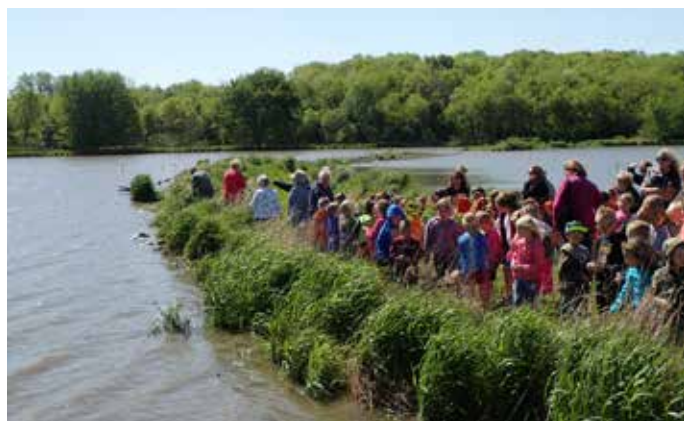
Iowa school children attend release of trumpeter swans in May 2017.

Give them time to reach full size, and this defensive behavior will be truly intimidating. Adult trumpeter swans are the largest birds in North America and the largest swans in the world, with few natural predators. They are beautiful to behold, and powerful. Given the chance, they take care of themselves, as history is proving. The Zoo looks forward to this year's cygnet getting that chance when it joins its wild flock in a few short months.